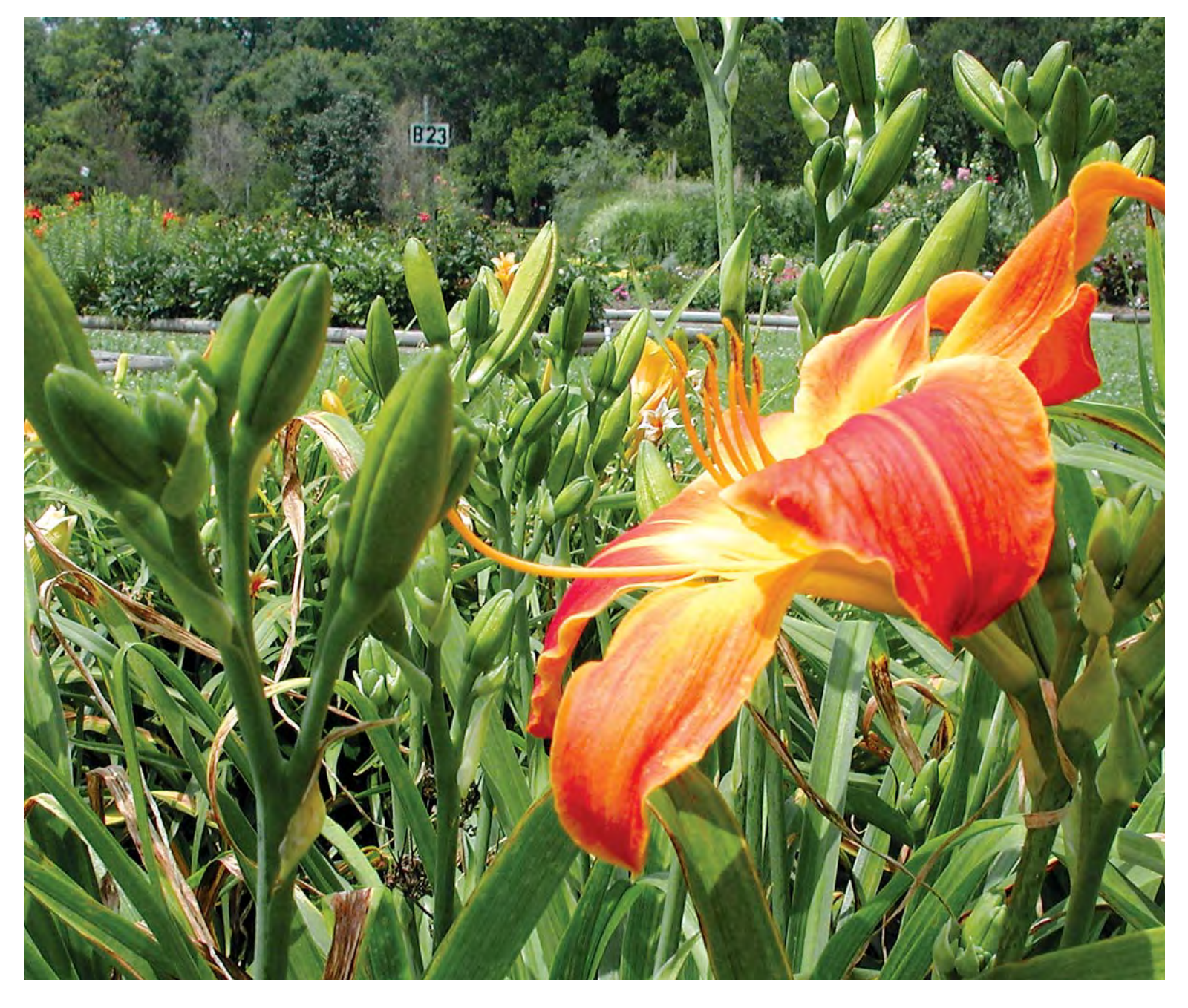
Mississippi Agricultural and Forestry Experiment Station