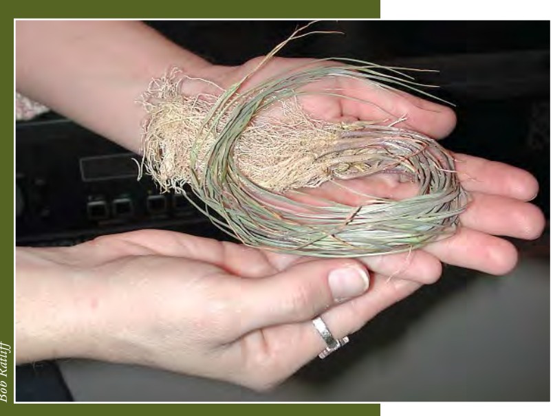
Freeze-dried wheatgrass is used in the project's NMR analyses.