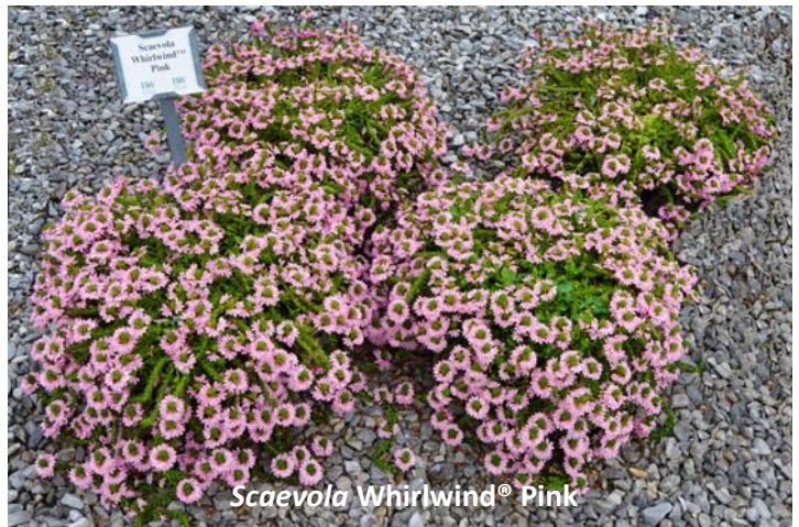
Scaevola Whirlwind ® Pink