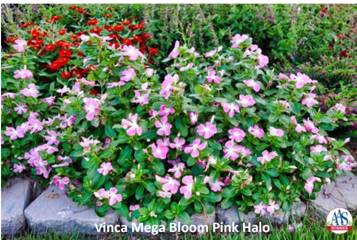
Vinca Mega Bloom Pink Halo