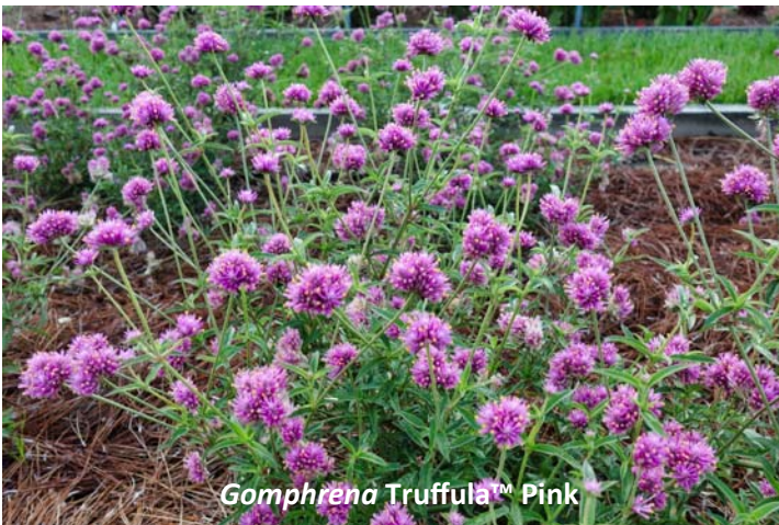
Gomphrena Truffula ™ Pink