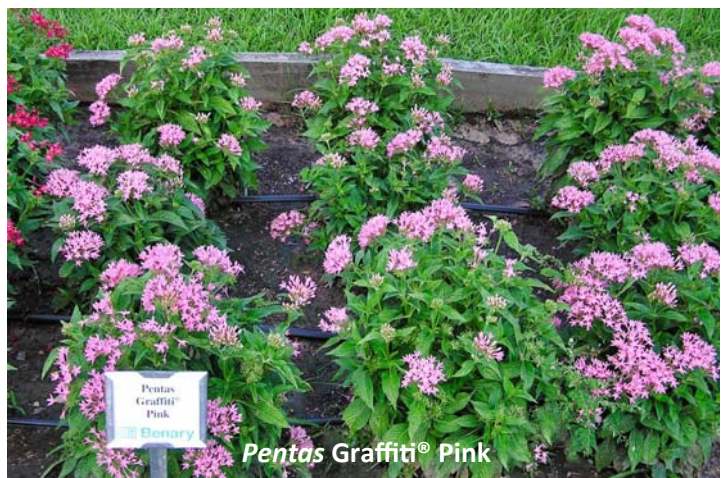
Pentas Graffiti ® Pink