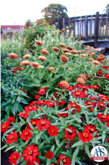
Zinnia Queeny Lime Orange and Zinnia Profusion Red

The AAS winners continue to provide a colorful show in the AAS Display Garden, thanks to the efforts of the Pearl River County Master Gardeners. Below are a few of the seed-grown varieties currently in flower.