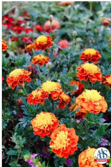
Marigold Super Hero Spry