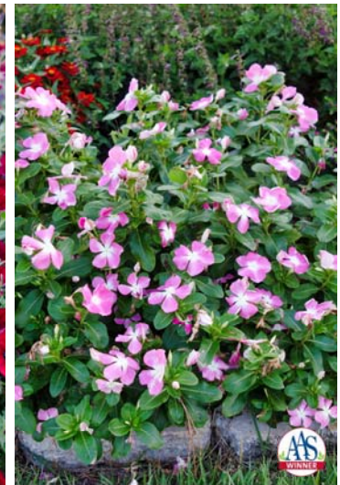
Vinca Mega Bloom Pink Halo