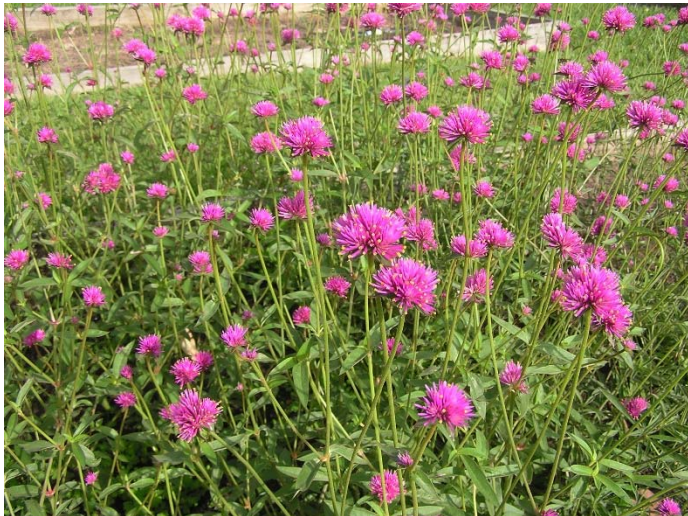
Gomphrena 'Fireworks' (above), from PanAmerican Seed, is a Mississippi Medallion plant from 2010 and a returning garden favorite. The electric pink flowers with bright yellow tips set this seed-grown variety apart.

Independence Day is upon us and summer has arrived. Plants that can take the heat, both new introductions and established favorites, are exploding with colorful flowers (including red, white, and blue) in the Trial Gardens.