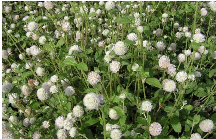
Gomphrena 'Las Vegas White' (above), seed-grown and on the market from Benary, was sent to us for a second year of evaluation. Spreading plants grow 12 to 18 inches tall and are covered with miniature snowballs.