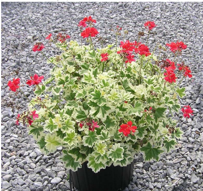
Pelargonium 'Glitterati Ice Queen' (above), new from Hort Couture (and developed by GardenGenetics), has made a bang in our container trials. We have seen no burn on the variegated foliage in full sun. Plant breeding efforts are resulting in greater heat tolerance of fancy-leaved geraniums.

Pentas 'Graffiti Red Velvet' (at right) is a new addition to the Graffiti series from Benary. The flowers of this Egyptian star-cluster are an intense red and stand out well against the foliage on compact plants.