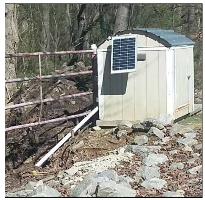
Figure 10. Water quality monitoring station.

In addition to the surface modeling, characteristics of the mainstream channel and three headwater tributaries were assessed using hydrologic and hydraulic characteristics (for example, flow velocity and depth). Results identified streambank erosion processes and channel changes within