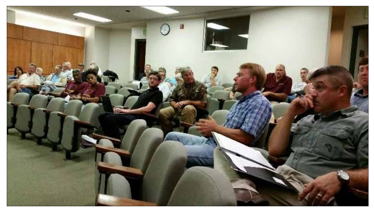
Figure 15. Meeting with Catalpa Creek stakeholders.