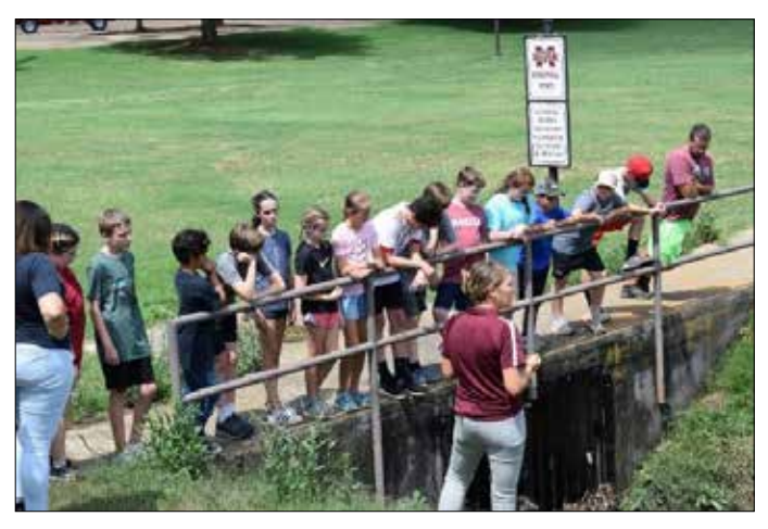
Figure 13. Experiential learning on water conservation in Catalpa Creek.

At a November 2019 landowner field day, participants reported the content was relevant to their needs and that they gained knowledge on NRCS landowner programs, private lands management, conservation benefits to soil, water, and habitat, and Farm Service Agency programs. After attending the program, respondents' intentions to implement conservation on their land (a combined 843 acres) improved an average of 0.6 points on a 5-point scale.