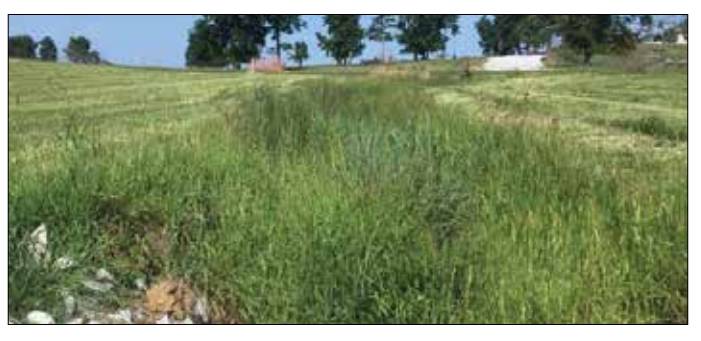
Figure 5. Vegetative strips in combination with weirs slow water and reduce erosion.