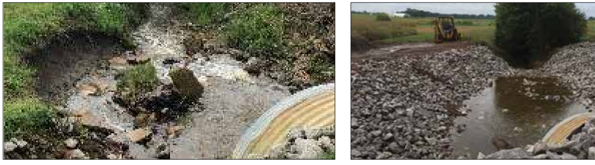
Figure 8. Pre-treatment bank conditions at a farm culvert.