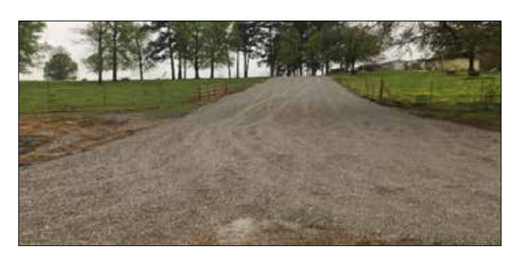
Figure 6. A major travel corridor for animals and equipment was reinforced.