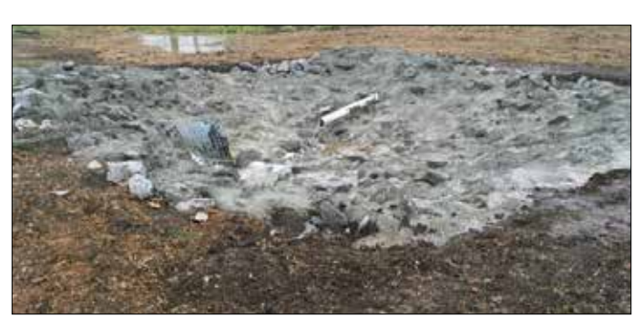
Figure 7. An area under a drainage pile was reinforced to stop erosion.