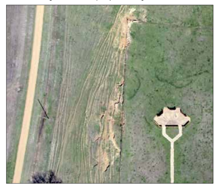
Figure 11. Image of erosion within the Catalpa Creek watershed taken from an unmanned aerial vehicle.