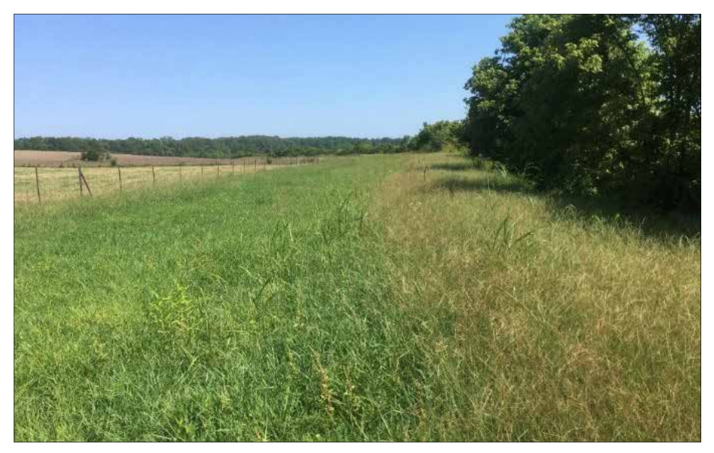
Figure 12: Streamside buffer dominated by grasses and forbs.

Invasive plant species are problematic on the banks of Catalpa Creek with Chinese Privet, Johnsongrass, and Japanese Honeysuckle making up more than one-third of the cover. However, vegetation sampling documented more than 40 native species, as well. To manage the vegetation, three methods to control Chinese Privet were investigated, and the hack-and-squirt method was found to be the most cost-effective method. Johnsongrass is being controlled with selective application of a non-selective herbicide (glyphosate), and research scientists and managers anticipate competition from seeded native species will help to control Japanese Honeysuckle.