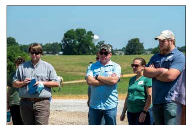
Figure 14. Field-based workshop on watershed conservation for landowners and natural resources professionals.

A web-based survey was designed to assess extension agents' understanding of water resources conservation. Eleven land management topics were chosen based on their relevance to water resource conservation in the southeastern United States. Seven states participated in the survey (Alabama, Arkansas, Kentucky, Mississippi, Oklahoma, South Carolina, and Virginia) for a total of 246 responses. Overall, participating extension agents rated the importance of land management topics greater than their perceived ability to educate landowners in these topic areas, which signals a need for further professional development on these topics and water resource conservation. The top three topics identified by agents as educational needs were water quality in streams or ponds, pathogen pollution in waterways, and water conservation.