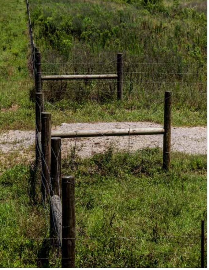
Figure 3. Fencing and heavy use protection (stream crossing) were implemented to address conditions shown in Figure 2.