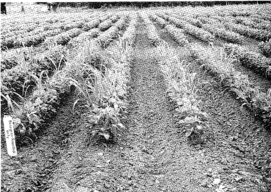
Figure 5. BASAGRAN (same as in 2 above). ROUNDUP (same as in 1 above). Shows fair control of Johnsongrass and excellent control of Cocklebur. Picture - July 17, 1979