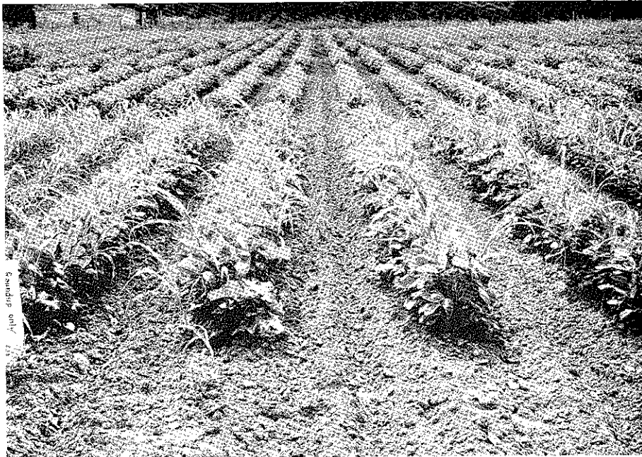
Figure 4. ROUNDUP (same as in 1 above). Shows fair control of Johnsongrass and no control of Cocklebur. Picture - July 17, 1979.

Our results indicate that a johnsongrass population of 52,200 to 154,200 plants/acre and a common cocklebur population of 24,800 to 53,500 plants/acre are about equally competitive with soybeans and that realization of maximum soybean yields requires a program for control of all weeds that are expected to be a problem in a soybean field. Additional benefits can be expected to accrue from repeated use of effective herbicide programs for control of johnsongrass when soybeans are grown in continuous rotation in fields with heavy infestations of johnsongrass.