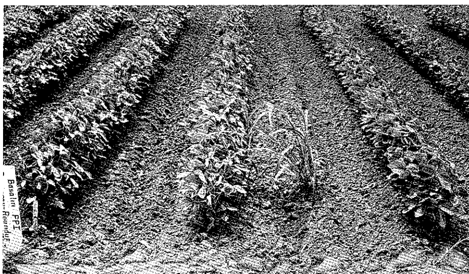
Figure 3. BASALIN (same as in 1 above). BASAGRAN (same as in 2 above). ROUNDUP (same as in 1 above). Shows excellent control of both Johnsongrass and Cocklebur. Picture - July 17, 1979.

Mid-season johnsongrass control of the main plots did not differ by treatment ( P < .05 ) in 1977 and 1978, and late-season control did not differ by treatment in 1977. Mid-season control in 1979 was significantly better with all preplant herbicides than for the untreated check, and fluchloralin was better than pendimethalin. Late-season control in 1978 did not