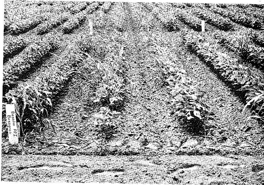
Figure 2. BASALIN (same as in 1 above). BASAGRAN 0.75 lb/A over-the-top early-season 1977, 1978, 1979 and repeated if needed. Shows fair control of Johnsongrass and excellent control of Cocklebur. Picture - July 17, 1979.